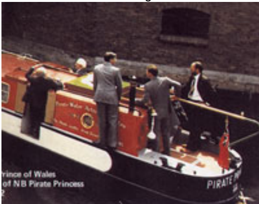
[25]As Charles will be our king one day, they didn't let us ransom him,

let us lock him in our dungeon and his ransom helped pay for the Pirate Castle