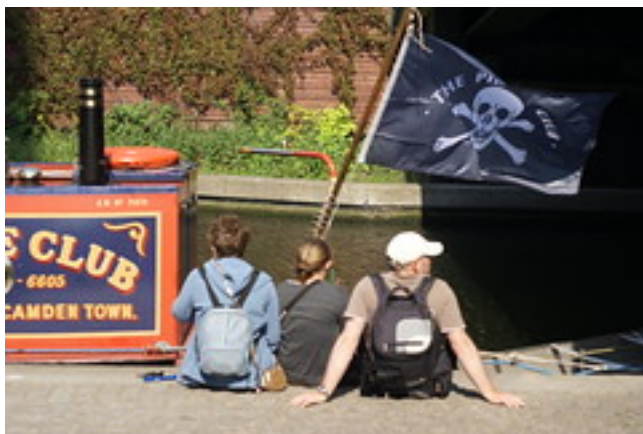
[11] Cavalcade 2011 [11]